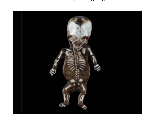
UOG Journal View the April highlights

The April issue of UOG includes a Stateof-the-Art Review on ultrasound imaging of slings and meshes in urogynecology, a study finding that women with advanced pelvic organ prolapse and levator ani muscle avulsion would benefit from mesh repair surgery, a registry study on the pregnancy and neonatal outcomes of <u>COVID-19</u>, a study on <u>perinatal outcome</u> after planned vaginal delivery in monochorionic compared with dichorionic twin pregnancy, and newly updated ISUOG Practice Guidelines (Part 2) on the performance of targeted neurosonography.