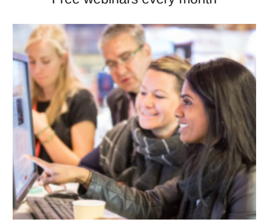
ISUOG Webinar Series Free webinars every month

We are pleased to announce the next webinar in our free ISUOG Webinar Series will be on Basic Training (BT). Register now to join esteemed faculty from around the world on 25 April from 12pm to 2pm BST. The webinar will focus on the 20+2 planes approach to the mid trimester scan and the six step approach in focused obstetric ultrasound examination plus feature demonstrations to help you learn to practice these techniques.