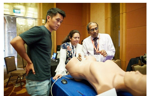
Delegates attend the theoretical and practical course components