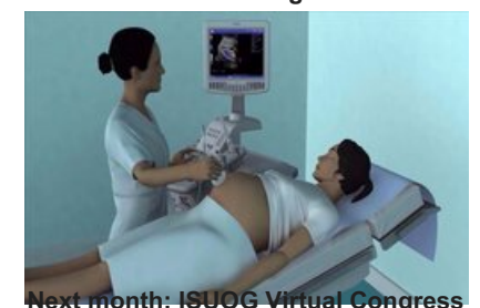
16-18 October 2020

Learn or brush up your knowledge on the essen Basic Training Flex. In addition to learning from webinars every week, watch live scans, and have including the live webinar, will be free for all to a