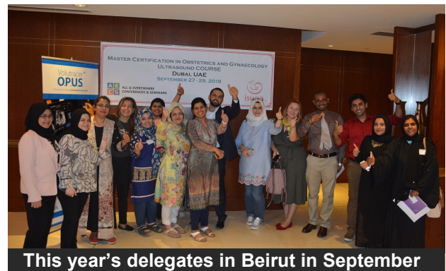
This year's delegates in Beirut in September

The Lebanon ISUOG Team is dedicated to expanding Lebanon's pilot experience in order to implement a standardized national curriculum in Ob/Gyn ultrasound training in Lebanon in the hopes that its ripple effect shall spread across the region, and subsequently the globe, in order to fulfill ISUOG's vision that all women have access to sonographic examinations carried out by skilled sonologists.