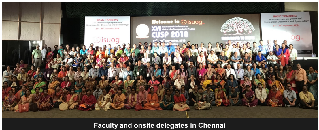
Faculty and onsite delegates in Chennai