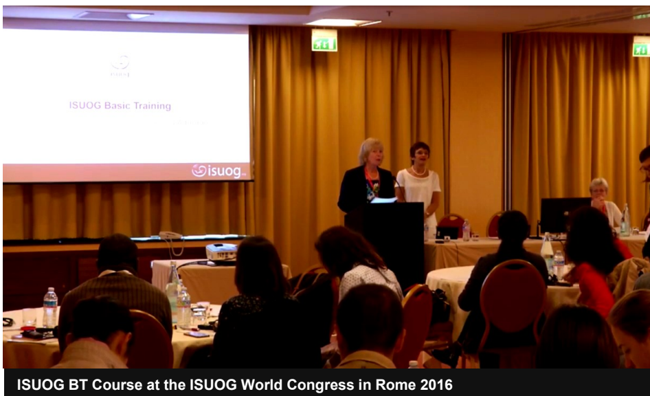
ISUOG BT Course at the ISUOG World Congress in Rome 2016