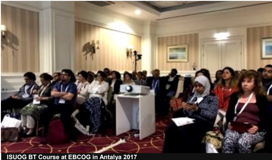
ISUOG BT Course at EBCOG in Antalya 2017