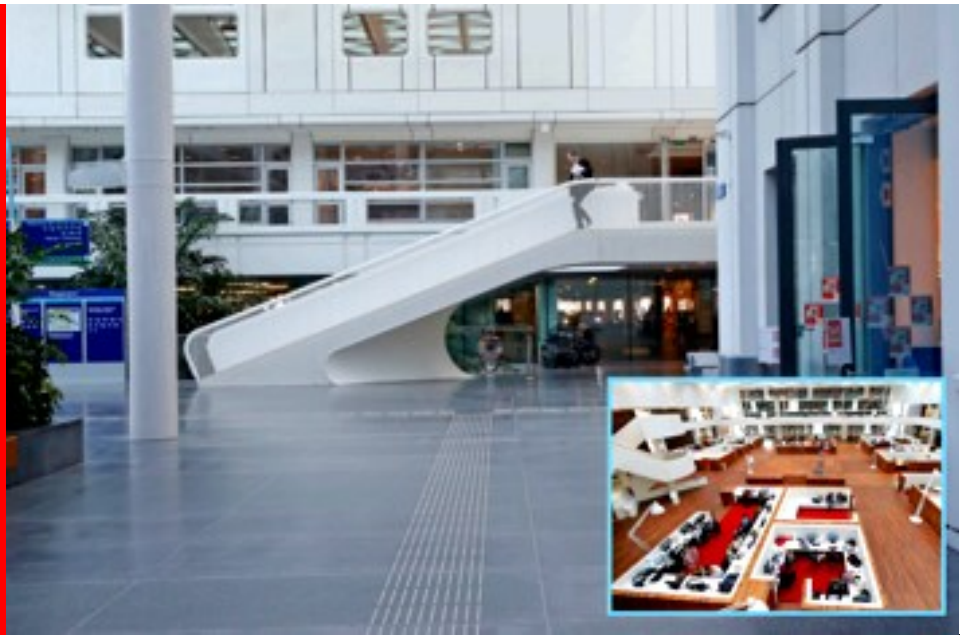
Rotterdam Lecture Hall

ISUOG has plans for future simulation-based workshops and welcomes your interest in setting up workshops in your area.